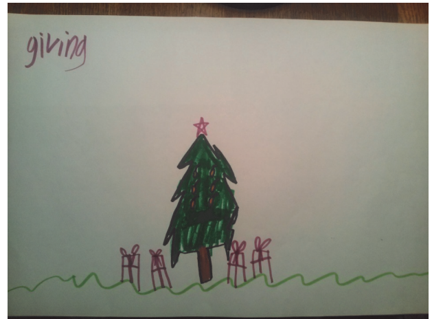
Violet Doherty Gr 2 Hemlock Creek Elementary School