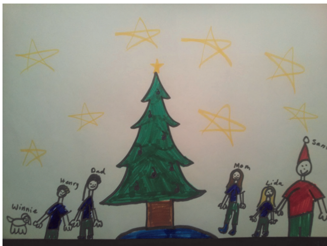
Lida Tellijohn Gr 4 Meadowbrook Elementary School 7