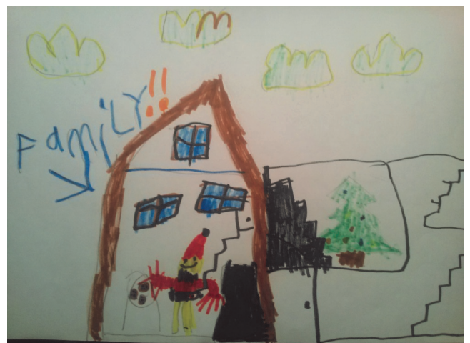
Henry Tellijohn Gr 1 Meadowbrook Elementary