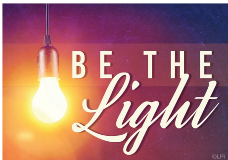
32 nd SUNDAY IN ORDINARY TIME